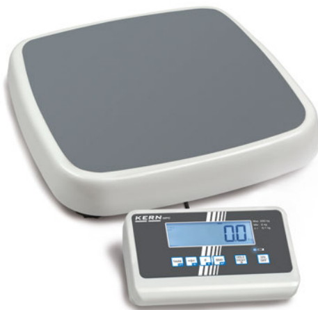
KERN MPC 250K100M

Professional personal floor scale – with EC type approval class III and approval for professional medical use in medical diagnostics