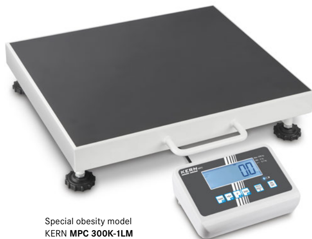
Special obesity model KERN MPC 300K-1LM